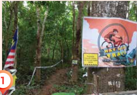
Mat Seni Line (1.0 km) - Blue Level

99 Bikes MTB Trail is managed by 99 Bikes Langkawi. This trail has 4 routes with a height of 118m and different levels of difficulty as follows: