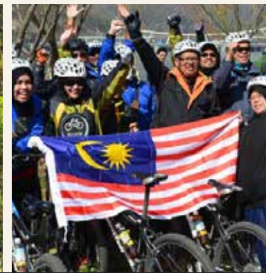
• Jom Kayuh Charity Fun Ride