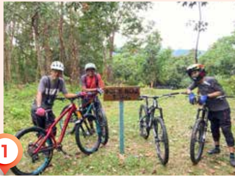
Che Bob Line (1.8 km) - Green Level

Chengkuan MTB Trail is managed by Island Mountain Bike Club (IMBC). This trail has 4 routes with a height of 120m and different levels of difficulty as follows: