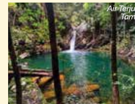
Air Terjun Tama