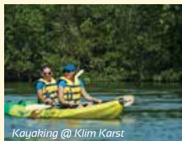
Kayaking @ Klim Karst