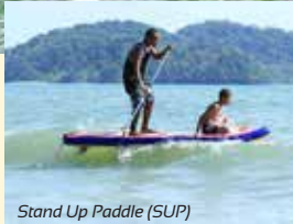
Stand Up Paddle (SUP)

It is the only place in Malaysia where coastal karsts and mangrove ecosystems co-exists today. Scattered across the geoforest are breathtaking limestone formations like Temple of Borobudur, Elephant Stone, and Hanging Gardens while the magnificent stalagmites and stalactites in the Gua Buaya, Cave of Legends, and Gua Kelawar await. The best way to see it is a leisurely boat ride along the tranquil Kilim River.