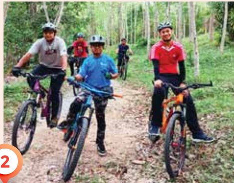
Downhill Line (1.0 km) - Blue Level