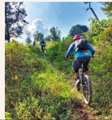
• Langkawi MTB Challenge