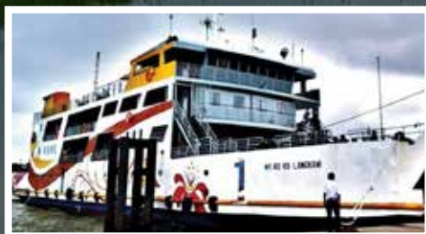
Langkawi Ro-Ro Ferry Service Sdn. Bhd.

Mobile : +6013 - 749 5881 / 013 - 721 3881