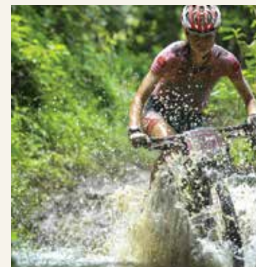
• Langkawi Enduro