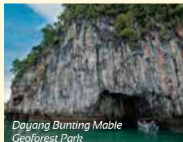
Dayang Bunting Mable Geoforest Park