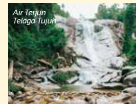
Air Terjun Telaga Tujuh