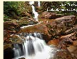
Air Terjun Lubuk Semilang