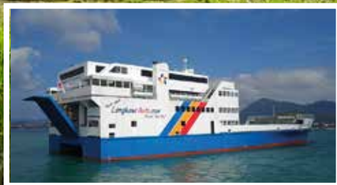
Langkawi Auto Express Sdn. Bhd.