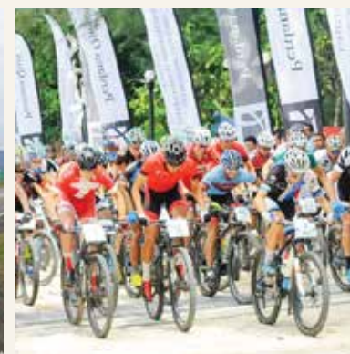
• Kisap MTB Challenge