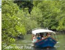
Safari Boat Tour