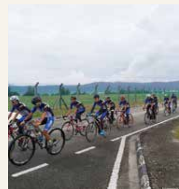
• Kayuhan Jelajah Langkawi