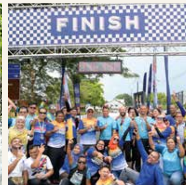
• Langkawi Legendary Ride