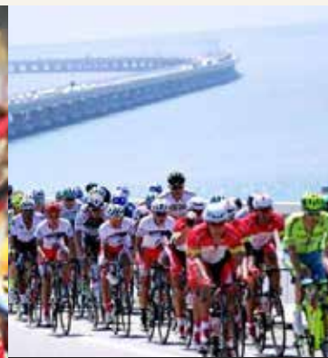
• Le Tour de Langkawi