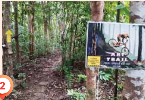
Art Line (1.0 km) - Blue Level