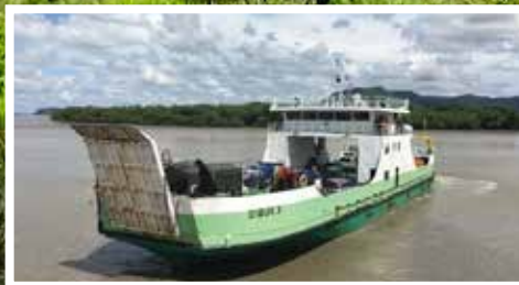
Dibuk Cargo Services Sdn. Bhd.