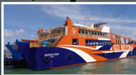
Wantas Shipping (Langkawi) Sdn. Bhd.