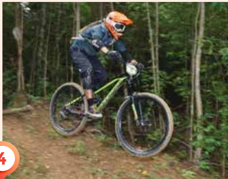
Yass Hanson Line (1.3 km) - Black Level