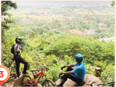
Iron Maiden Line (1.2 km) - Black Level