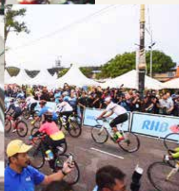
• RHB Ride Langkawi