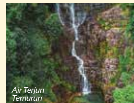
Air Terjun Temurun