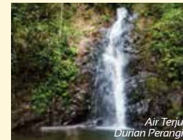
Air Terjun Durian Perangin