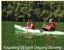
Kayaking @Tasik Dayang Bunting