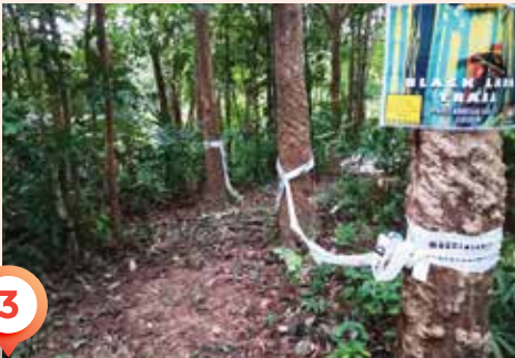
Black LADA Line (1.2 km) - Black Level