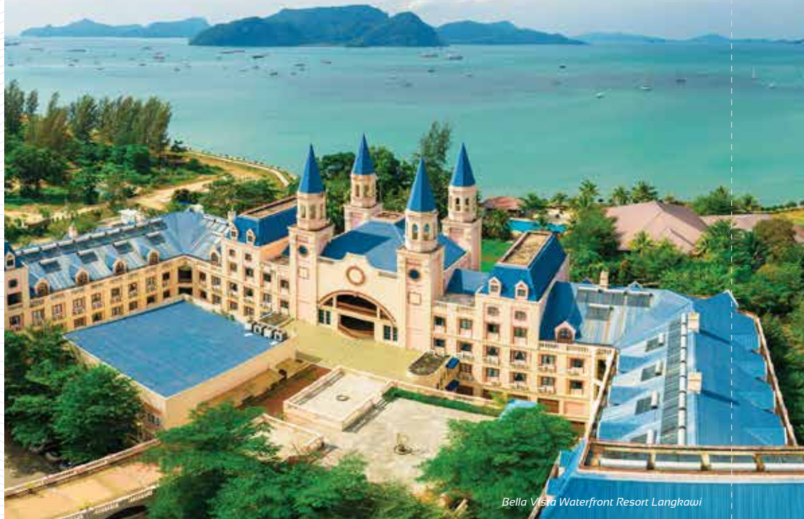
Bella Vista Waterfront Resort Langkawi

Whether you're planning a wedding or business conference, seeking a romantic getaway with the one you love or looking to take your family on a fun filled holiday, Langkawi has something for everyone.